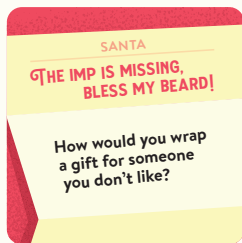
Santa card (red Christmas side)