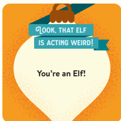
Role card, Elf version