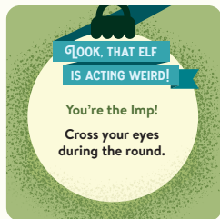
Role card, Imp version (with secret rule)