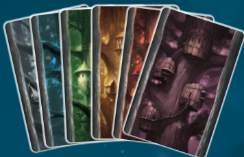
108 guild cards in 6 colours (18 per colour)