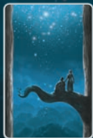
1 firefly festival card