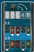
5 overview cards