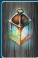
1 starting player card