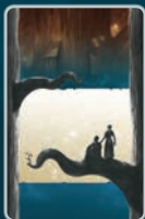
5 greetings cards