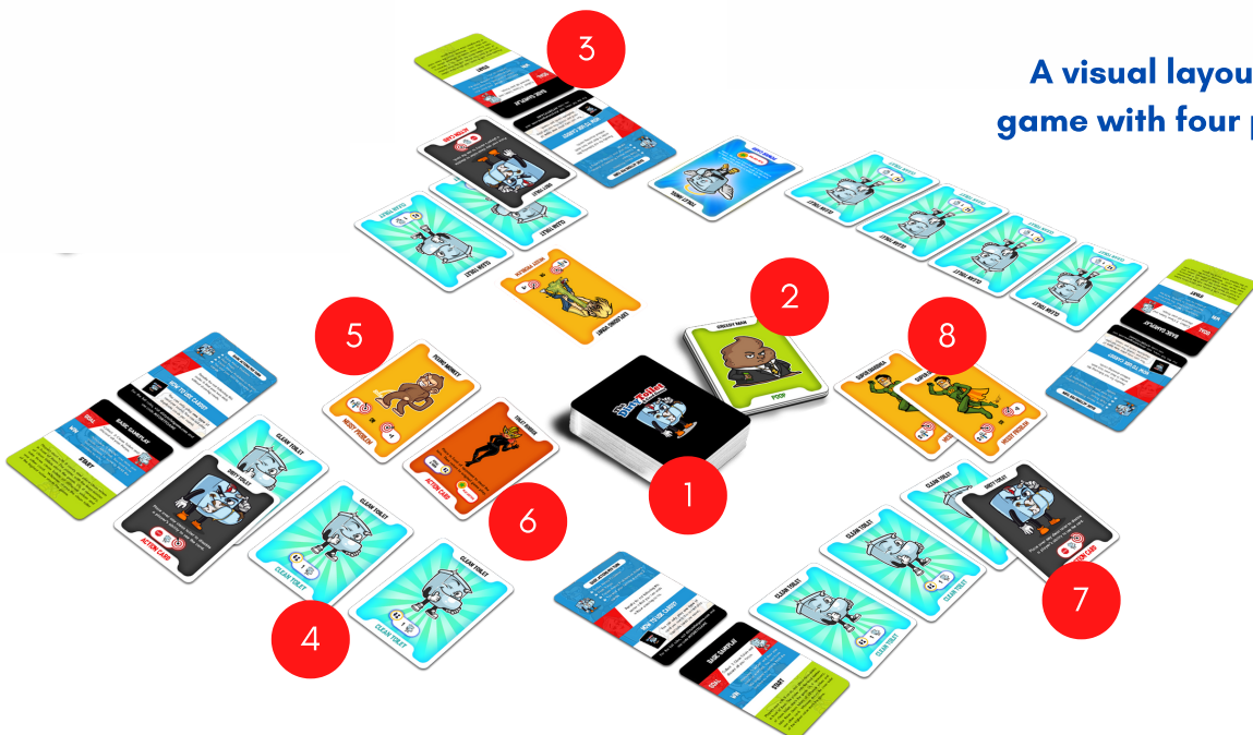
A visual layout of a game with four players.