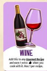
WINE Add this to any Gourmet Recipe and earn 1 extra when you cook with it. Max 1 per recipe.