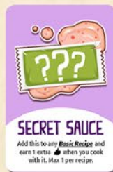
SECRET SAUCE Add this to any Basic Recipe and earn 1 extra when you cook with it. Max 1 per recipe.