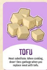
TOFU Meat substitute. When cooking, draw 1 less garbage when you replace meat with tofu.