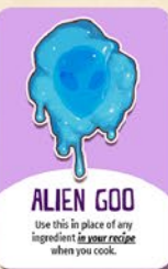
ALIEN GOO Use this in place of any ingredient in your recipe when you cook.