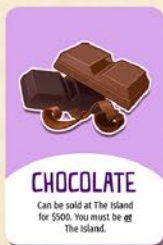
CHOCOLATE Can be sold at The Island for $500. You must be at The Island.