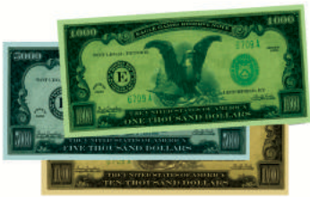
Money ($1,000; $5,000; $10,000 bills)