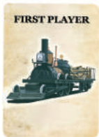
First Player Marker

Engine Cards These represent the investment in upgrading all of the locomotives of a particular railroad by replacing an older model with a newer, better model. All railroads start with a "1." The number on the card is the maximum number of "links" that a goods cube may be delivered by that player.