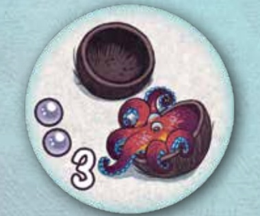
Front (showing the cost and 3 points)

Note: if this movement causes a group of seagrass or anemones to split, the bonus clownfish or seahorse already gained by the player is not lost, even if the groups are now no longer large enough to attract the bonus tokens.