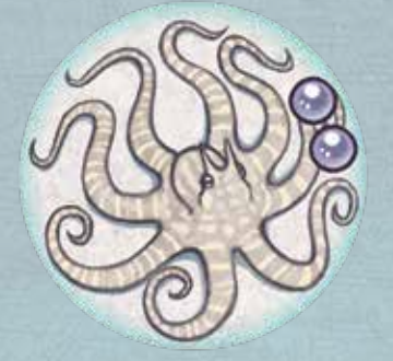
Front (showing the cost)

At any time, a player may declare that a mimic octopus token in their garden has become an anemone or seagrass token (to complete a group). Once the player declares the octopus's type, the octopus tile is flipped over to its camoflagued side and may not be used again during the game. The octopus itself does not score.