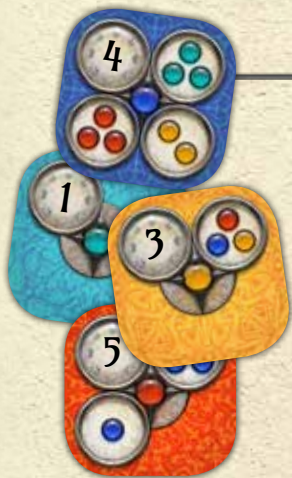
1 Moon Wheel