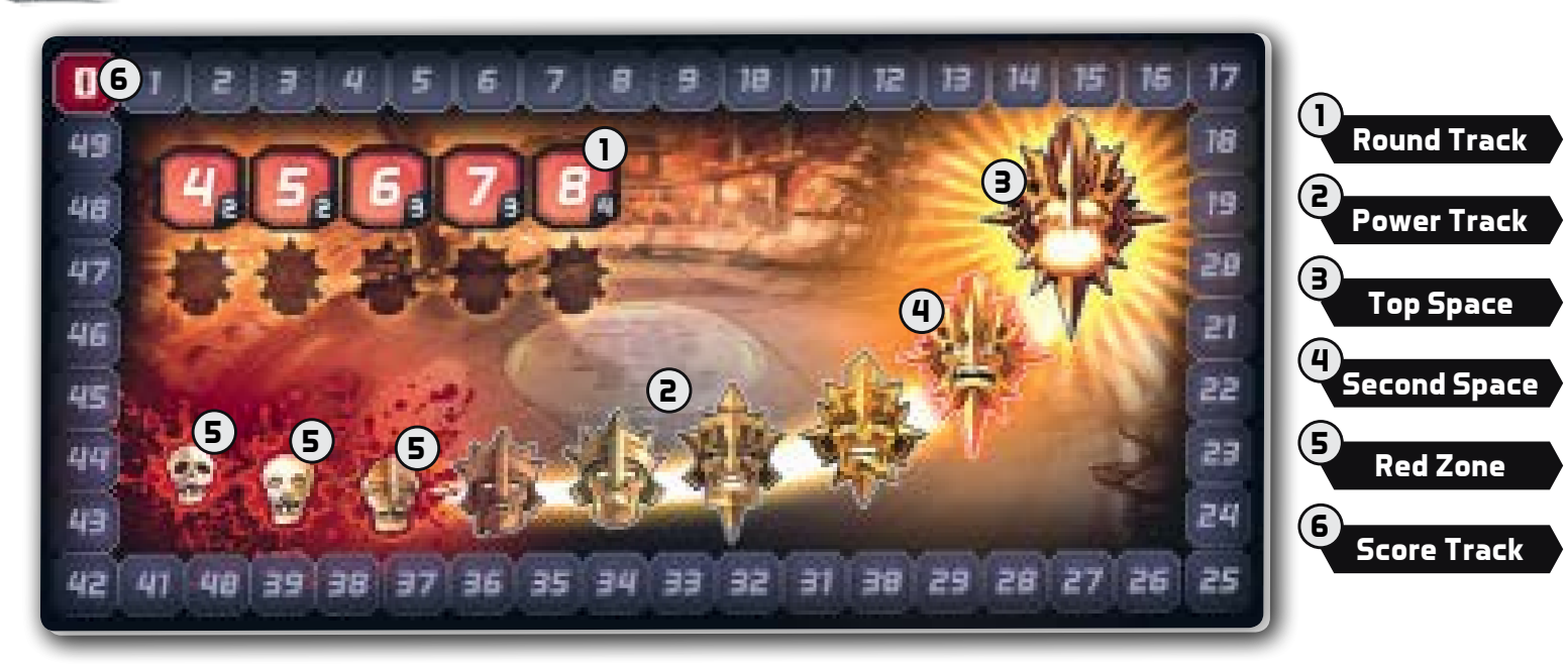
Main Board with Power Track