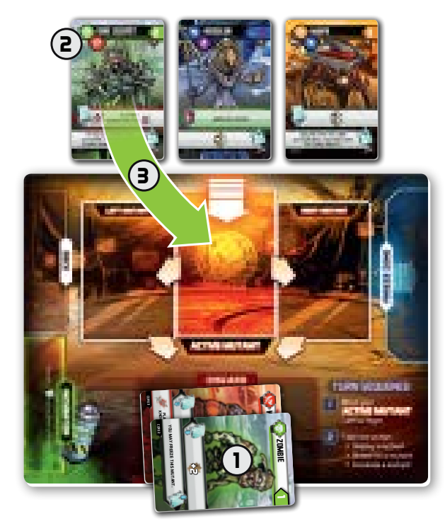
Example of Breed action

IMPORTANT: Breeding an Advanced Mutant with two of the same gene does not require discarding two copies of that gene, but you must still discard two cards.