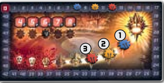
In this example, red player will take first next round

Reset Power Markers - The player who currently has the lowest total number of Victory Points places their Power marker in the Second Space 1. Then, the next player above them on the score track places their Power Track marker in the space behind the previous player 2, and so on until all the Power markers of all players are on the Power Track 3. The player whose marker is the furthest from the Top Space will take the first turn in the next round, with turn order proceeding clockwise from them. In the case of tied score the player whose marker is on the bottom of the stack is considered to have a lower score.