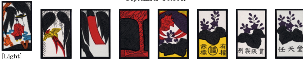
[Light] [Rain] [Animal] [Slip] [Dregs] [Light] [Dregs] [Dregs] [Dregs] November December