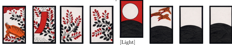
[Animal] [Slip] [Dregs] [Dregs] [Light] [Moon] [Animal] [Dregs] [Dregs] July August