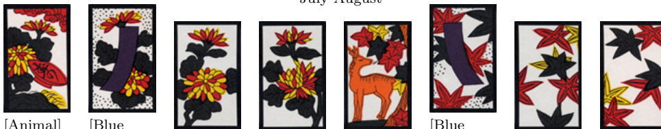
[Animal] [Sake] [Blue Poem] [Dregs] [Dregs] [Animal] [Blue Poem] [Dregs] [Dregs] September October