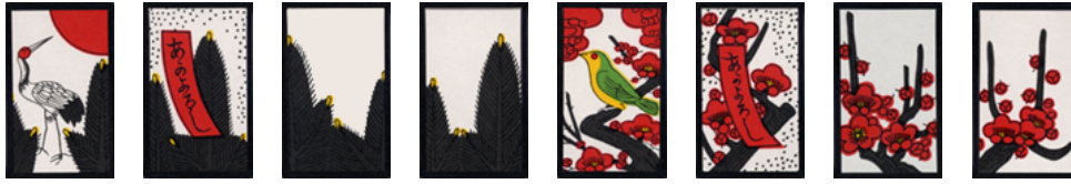
[Light] [Red Poem] [Dregs] [Dregs] [Animal] [Red Poem] [Dregs] [Dregs] January February