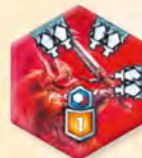
A Melee attack with a strength of 2 in 3 directions