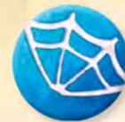
1 Net marker (Dragon Empire faction)