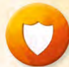
1 Entrenchment marker (Guardians of the Realm faction)