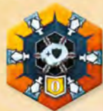
Guardians of the Realm Banner