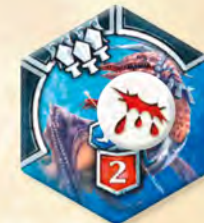
A Wound marker placed on a wounded Board tile.

When a tile is wounded but not destroyed (because it has the Toughness Feature - see page 13 for more details), put a Wound marker on it to indicate that it has been hit. The Banner is the only exception, as its damage is marked on the Hit Point track.