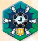
Harbingers of the Forest Banner