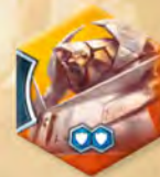
Examples of Champion tiles

On the front of Champion tiles, in addition to the illustrations of individual champions, there are symbols defining the abilities of each tile (for example Melee attack, Ranged attack, Armor, or Net) as well as icons representing their Features.