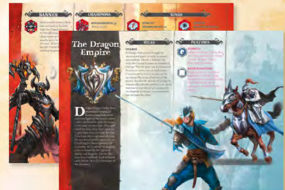
4 faction reference sheets (1 per faction)