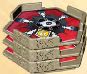
Example: A folded Monolith with the Lords of the Abyss tiles.

After preparing the Monoliths, the player mixes his faction's tiles and continues to prepare the game as usual. Monoliths are placed on the board in the same way that Banners are placed.