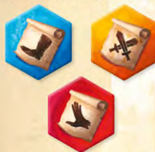
Example of Order tiles

Here are some examples of the two tile types: