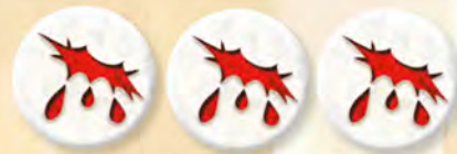
22 Wound markers