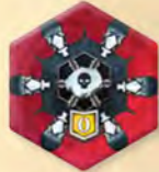
Lords of the Abyss Banner

Each Banner has 20 Hit Points which are reduced through successful enemy attacks. If the number falls to 0, the Banner is destroyed and the faction it belongs to loses the game.