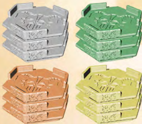
12 plastic Monolith segments