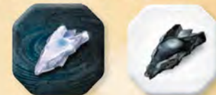
2 Alliance Hit Point markers (1 per Alliance)