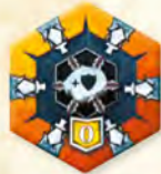
Guardians of the Realm Banner