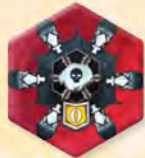
Lords of the Abyss Banner

5. Mix the tiles well, this is extremely important!