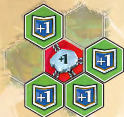
Example: Rune of Minor Acceleration affecting friendly (connected) tiles in four directions.

The influence the Rune has on the tile is depicted as a symbol in the center of the tile.