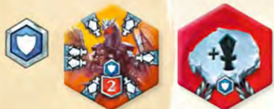
Toughness icon and two tiles with this Feature.

Most of the Board tiles have only 1 Hit Point (except for the Banners and tiles with the Toughness Feature), so after receiving 1 Wound they will be eliminated.