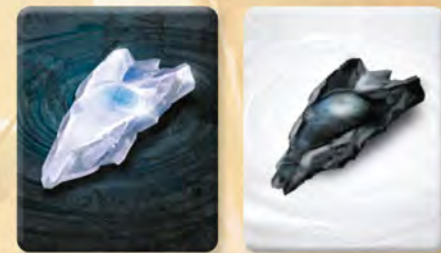
4 Alliance tiles (for multiplayer games)