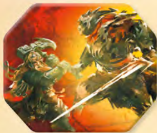
1 Active Player tile (for multiplayer games)