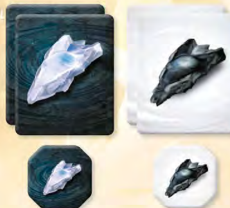
The Alliance tiles (one for every Alliance member) and the Alliance Hit Point markers (one for every Alliance).