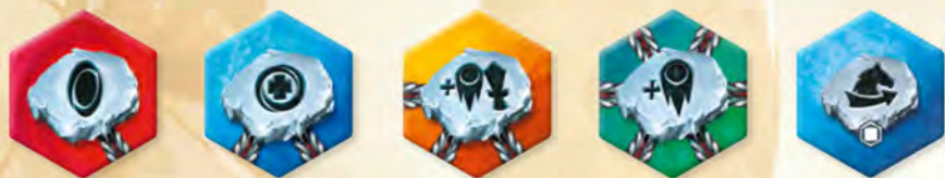
Examples of Runes affecting tiles in one direction, two directions, three directions, all directions, and for the entire board.

Runes affect all adjacent tiles connected to them. Rune connection paths printed along the edges show the direction in which they can connect to another tile. In most cases, these are other tiles in a player's own faction.