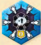
Dragon Empire Banner