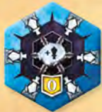
Dragon Empire Banner

4. From the 35 tiles, each player places the Banner tile aside and shuffles the remaining tiles. The Banner can be distinguished from the other tiles as it is identical on the front and back.