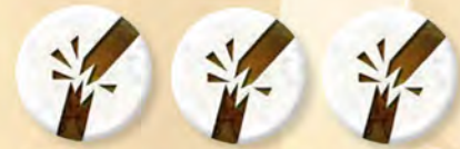
4 Disarmament markers