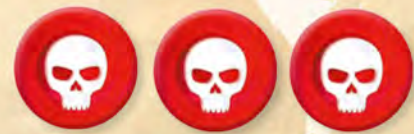
5 Poison markers (Lords of the Abyss faction)