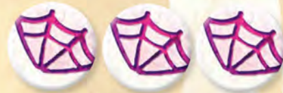
6 Net markers