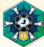
Harbingers of the Forest Banner