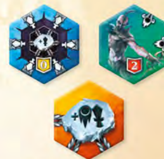
Example of Board tiles

Both types of tiles can only be used during a player's own turn. Under no circumstances can tiles be played during any other player's turn.