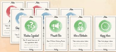
Action Cards (keep in hand)