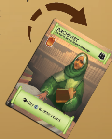
Tasking an ally

Products that you generate during your turn—or on any other player's turn—only last until the end of that turn. You cannot carry unused products from one turn to the next.