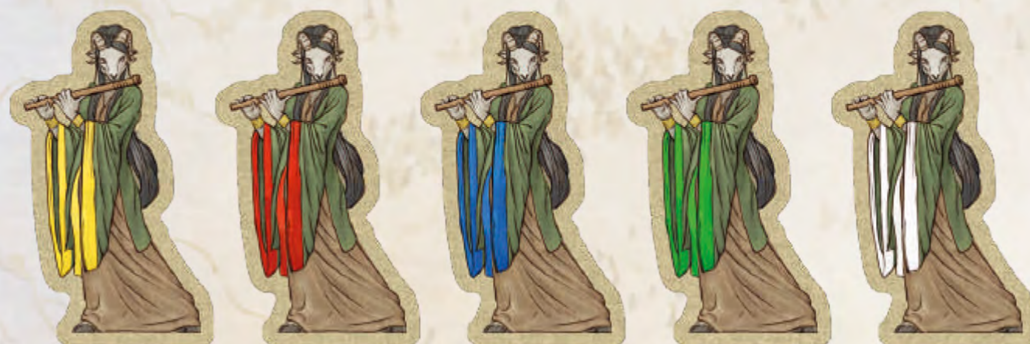
Governor Soldier Farmer Trader Artisan

You control a dynasty of 5 leaders. Each leader in your dynasty has the same appearance, but is one of 5 different colours, corresponding with the 5 tile types: