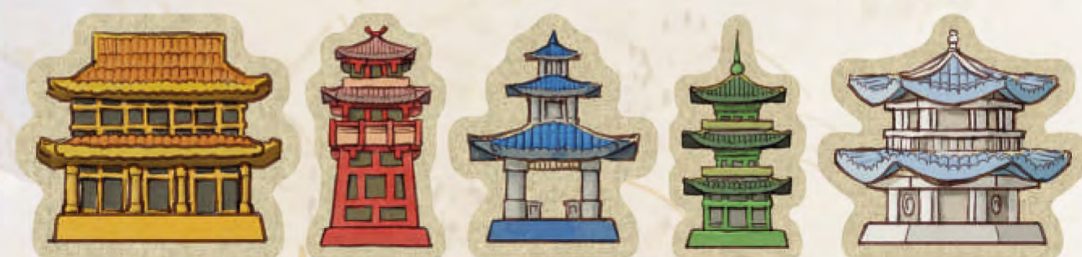
Court Garrison Granary Market Workshop

After placing a tile, you may establish a pagoda if the tile has been placed such that creates a 'triangle' of 3 tiles of the same colour, provided that: