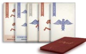
60 PROPAGANDA CARDS