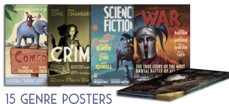
15 GENRE POSTERS