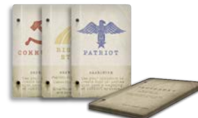
9 LOYALTY CARDS