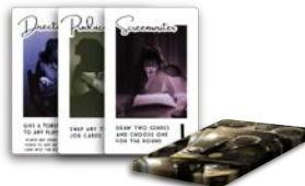
9 JOB CARDS