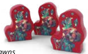
6 Explorer Pawns