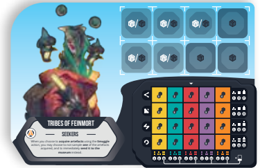
2 Faction Boards