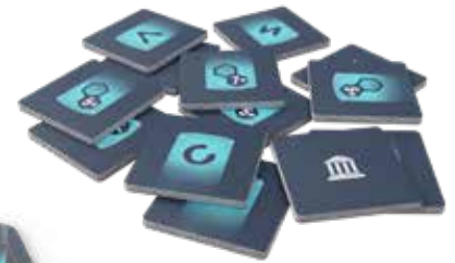
18 Exhibition Tiles