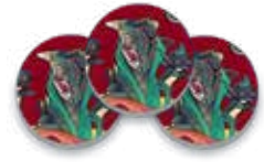
6 Achievement Tokens