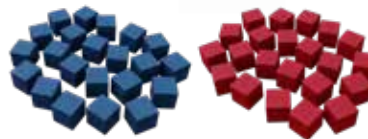
44 Crew Cubes

If you acquire an artefact you have sampled before, you may also choose to send it, since technically you did not sample it this time.