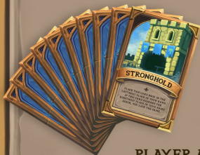
PLAYER A HAND

They then place their "Watchtower" card in the leftmost place in their hand.