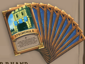
PLAYER B HAND

The player who crossed a bridge last becomes the first player. For their first turn, they begin the game with only 6 Mana.