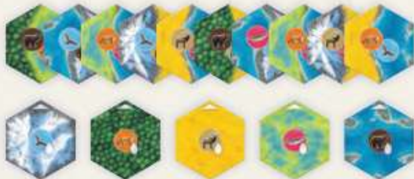
85 Habitat Tiles including 25 Keystone Tiles (Mountains, Forests, Prairies, Wetlands, Rivers)

Your game of Cascadia should include the following. If it doesn't, please go to https://alderac.com/customer-service