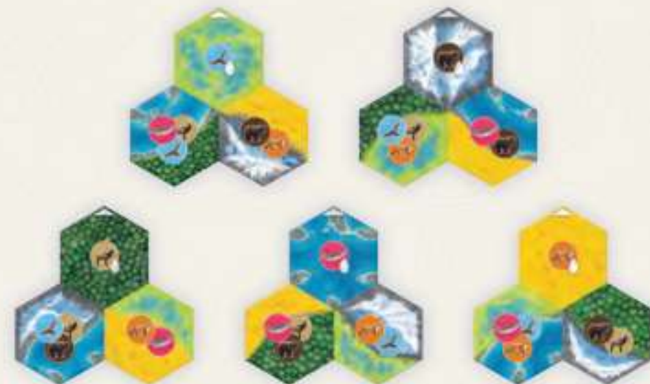
5 Starter Habitat Tiles