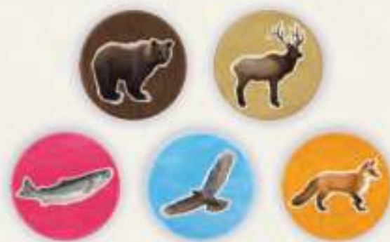
100 Wildlife Tokens (20 Bear, 20 Elk, 20 Salmon, 20 Hawk, 20 Fox)