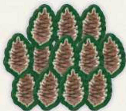
25 Nature Tokens (Cones from the mighty Douglas Fir)