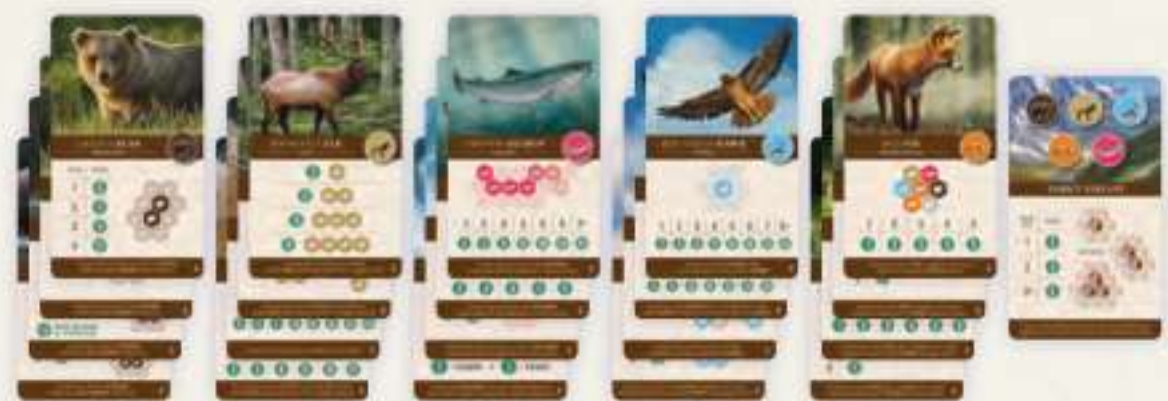
21 Wildlife Scoring Cards (4 Bear, 4 Elk, 4 Salmon, 4 Hawk, 4 Fox, 1 Family/Intermediate)