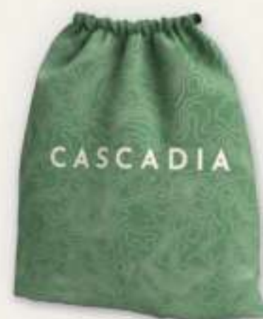
1 Cloth Bag (For Wildlife Tokens)