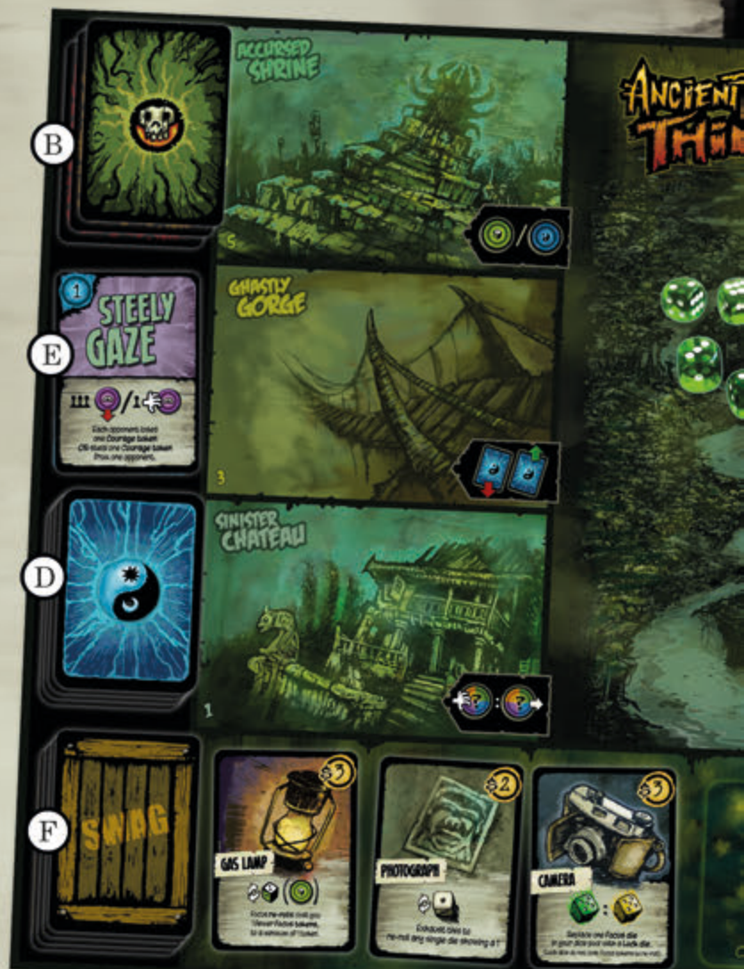
Game board set-up