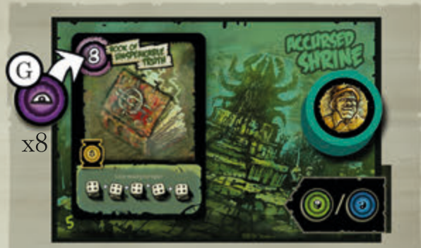
Example: The Captain now has the option to spend 8 Courage tokens to perform a Desperate Act, to immediately overcome the Book of Unspeakable Truth, and add it to their score stack.