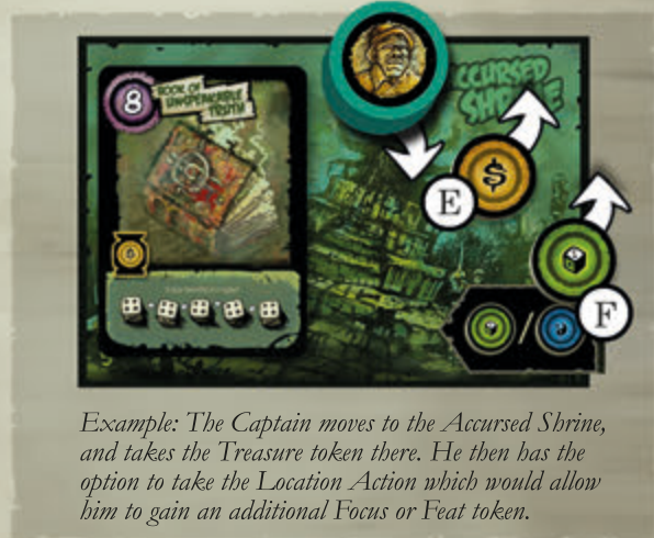
Example: The Captain moves to the Accursed Shrine, and takes the Treasure token there. He then has the option to take the Location Action which would allow him to gain an additional Focus or Feat token.