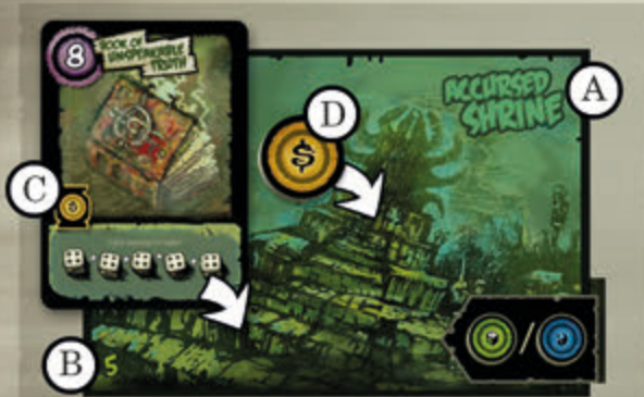
Example: Book of Unspeakable Truth is added to the Accursed Shrine, and a Treasure token is added to the Location, as per the Artefact icon on the Encounter card.